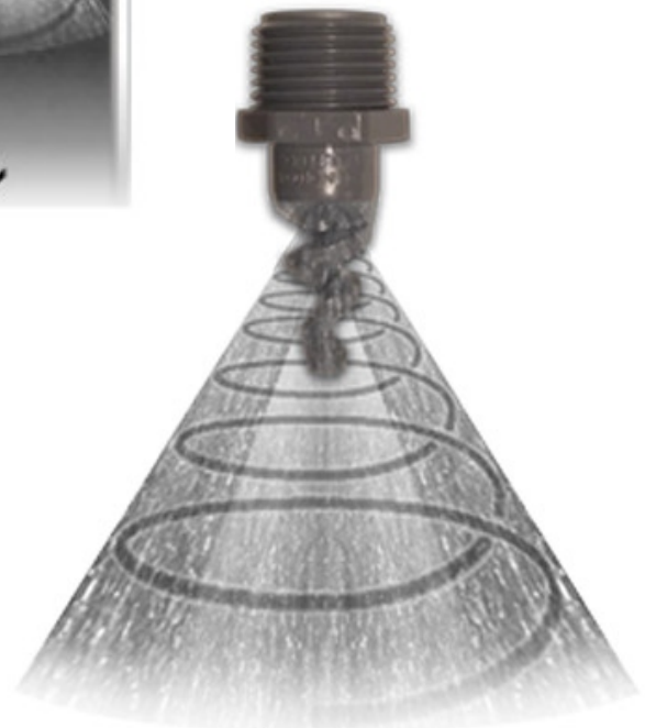
Non-Clogging Double Spiral Spray Nozzle