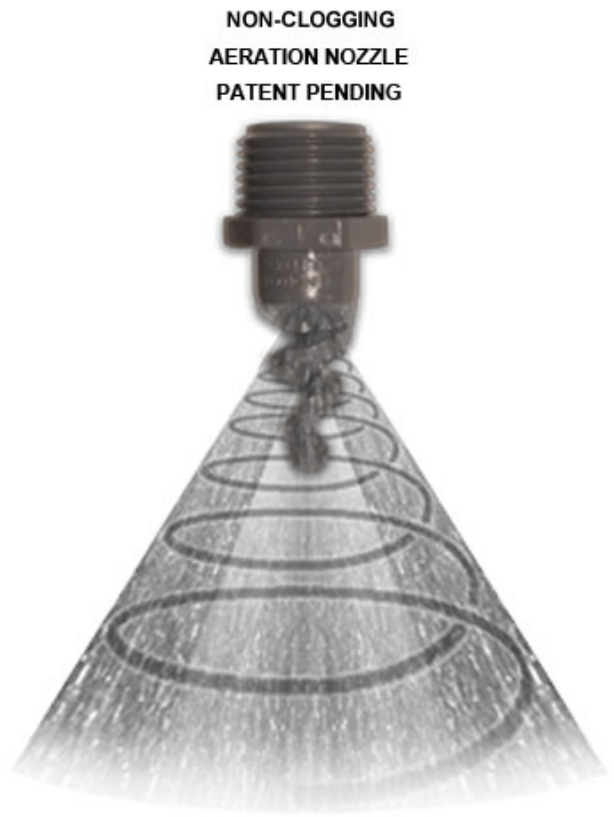
Each aeration nozzle produces a spiral double cone of spray, a spiral inner cone of spray within a spiral outer cone of spray. This patent pending spray action doubles the aeration process.